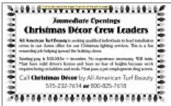
All American Turf